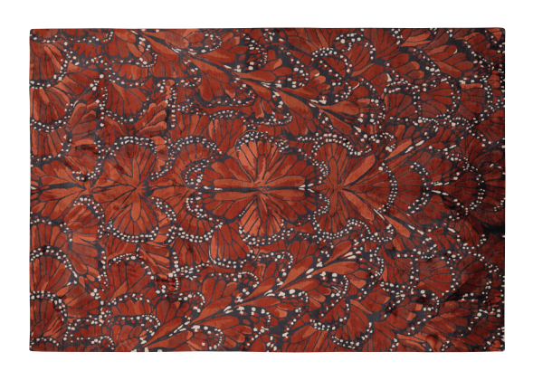
"Monarch Fire" rug from Avenue Road.