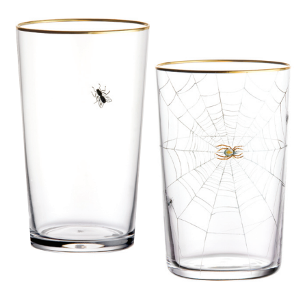
Drinking glasses from Avenue Road.

For the keen trend followers, insect prints of all kinds are a quirky 2014 motif. Go gentle with a colourful butterfly print, or let a bug or beetle keep you company.