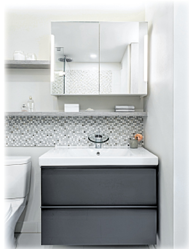
The most important step to getting and maintaining a clean, spa-like space is to edit out unnecessary clutter.