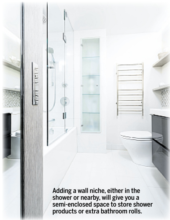
Adding a wall niche, either in the shower or nearby, will give you a semi-enclosed space to store shower products or extra bathroom rolls.

front but once you know these tricks, it'll be a breeze to keep your bathroom looking camera-ready every morning, before you've even fixed your bedhead!