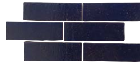
FIRECLAY TILE: Abyss Glazed Thin Brick