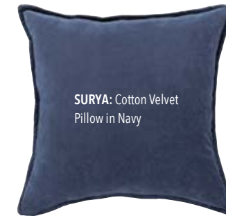
SURYA: Cotton Velvet Pillow in Navy

FOR A SOPHISTICATED SCHEME, ADD NAVY ELEMENTS IN INTERESTING TEXTURES.