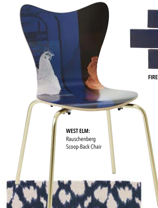
WEST ELM: Rauschenberg Scoop-Back Chair

Try this: Paint a cool half-wall treatment (all over or just an accent wall) up to about 54 inches, and leave the upper half white or off-white. Use this line or a bit higher as a centre point for some framed photos, to break up the look a little more. Now you’ve got an architectural look that retains an open and breezy eyeline, so the space feels enriched but not overwhelmed.