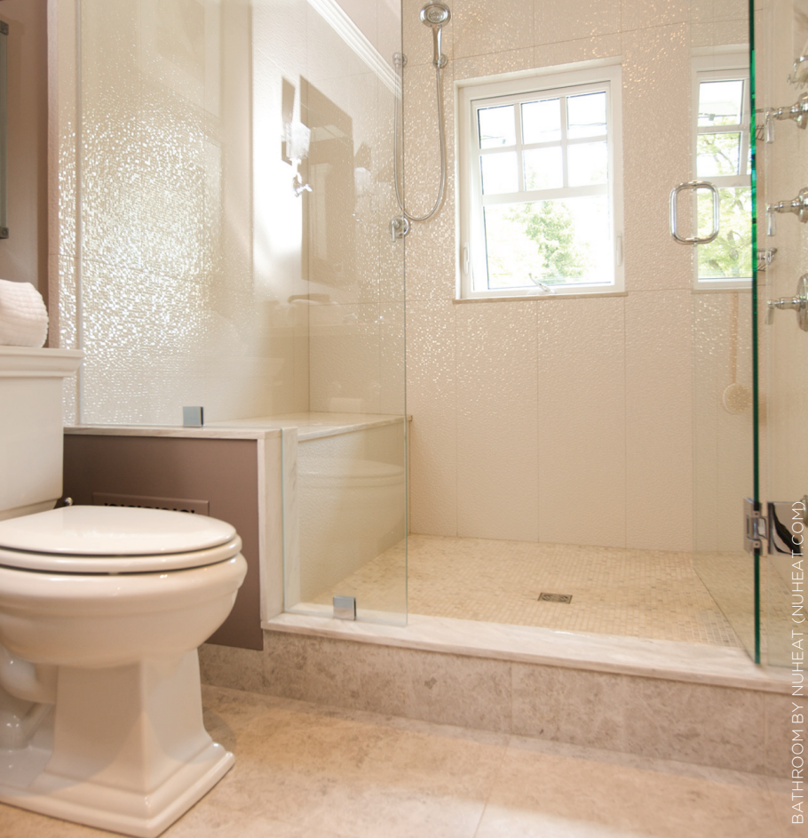
BATHROOM BY NUHEAT (NUHEAT.COM)