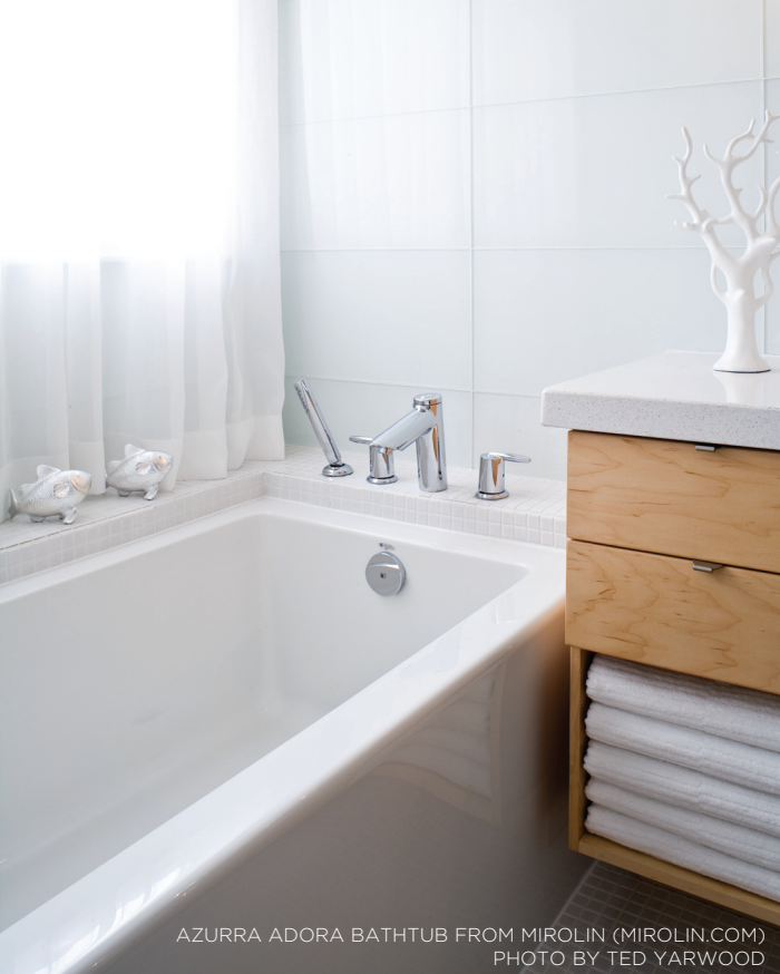
AZURRA ADORA BATHTUB FROM MIROLIN (MIROLIN.COM)

that works; keeping in mind the flow of traffic, having enough space to move around comfortably, the right amount of clearance to open doors and drawers, and the end result in the way everything looks in relation to each other. Manipulating the layout can increase your floor space, but you might also be able to move walls to give yourself even more room. If you have a linen closet next to the bathroom or closet from another room that is on the other side of the wall, you might be able to shorten the closet depth to give you a couple extra square feet for your bathroom. Explore all of your options before beginning work.